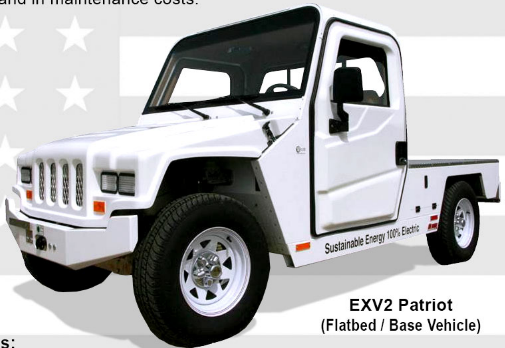
EXV2 Patriot (Flatbed / Base Vehicle)

The EXV2 Patriot is the definition of a game changer. That's right, America's most capable electric work truck is now even better. It is proof that electric utility vehicles aren't only gaining popularity because of cost savings, they can also be tough, quality built, comfortable, and able to get the job done. At only two cents a mile to operate, you will not only be enjoying the comfort of your ride, you will be saving money in fuel and in maintenance costs.