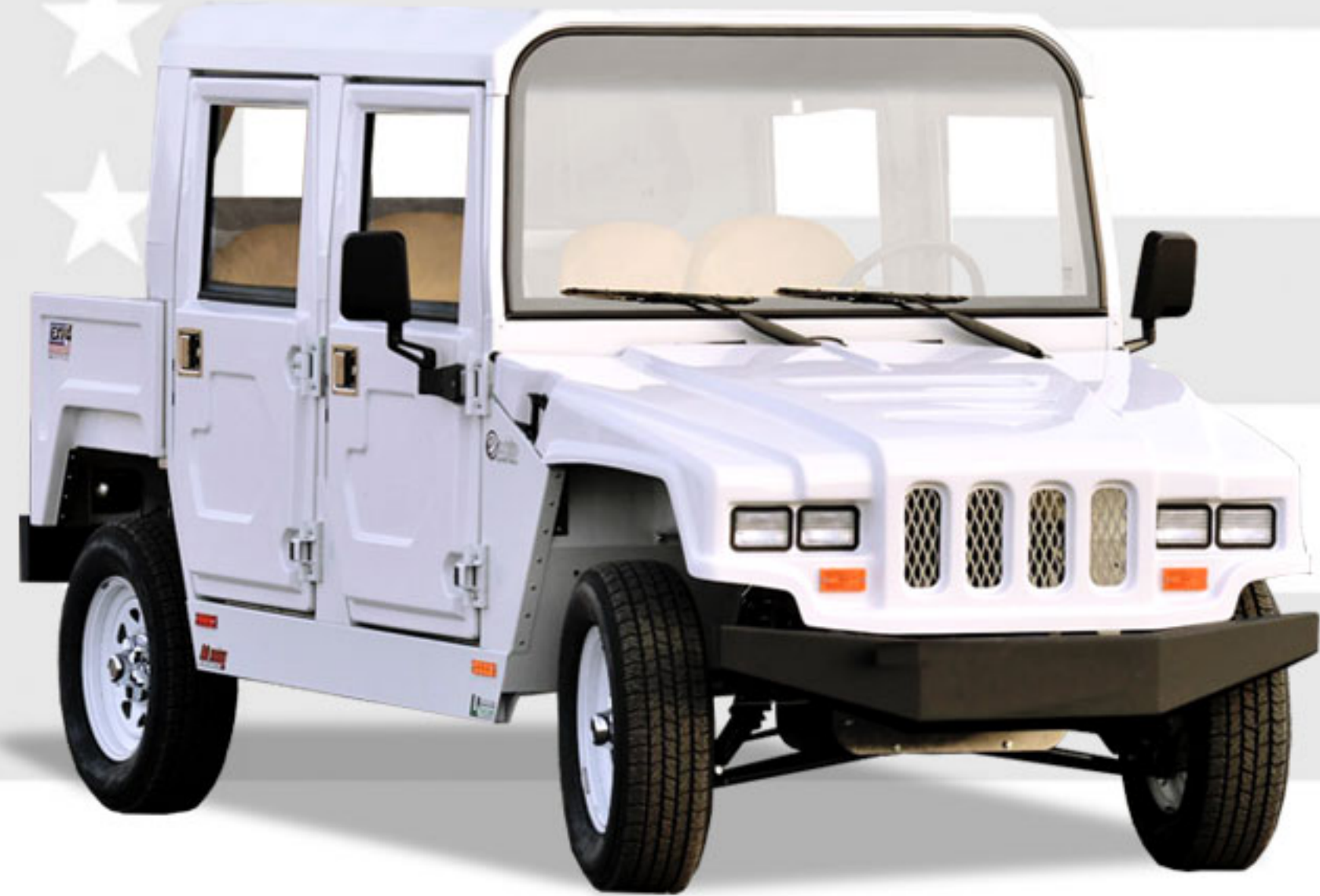
EXV4 (Base Vehicle)

This American Utilitarian is proof that NEV's, neighborhood electric vehicles, aren't only gaining popularity because of cost savings or being green. They can also be tough, quality built, comfortable, and able to get the job done. At only estimated cost of three cents a mile to operate, you will not only be enjoying the thrill of the ride, you will be saving money in fuel and in maintenance costs while meeting your every day initiatives, mandates, and goals to go green.