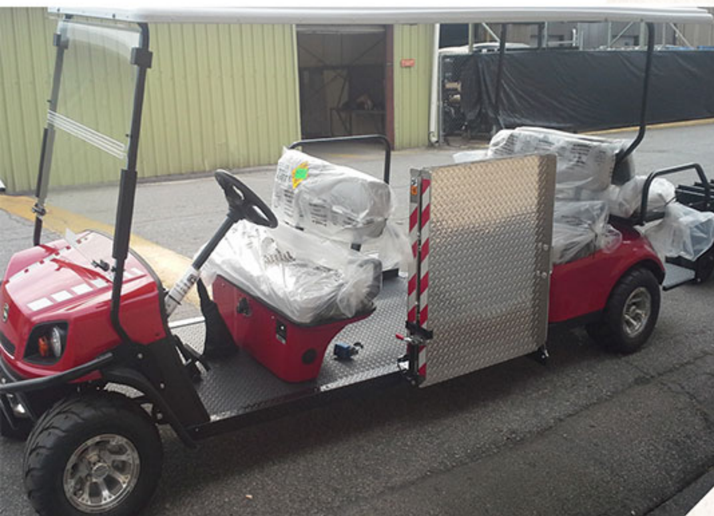
CUSHMAN SHUTTLE Wheelchair Package