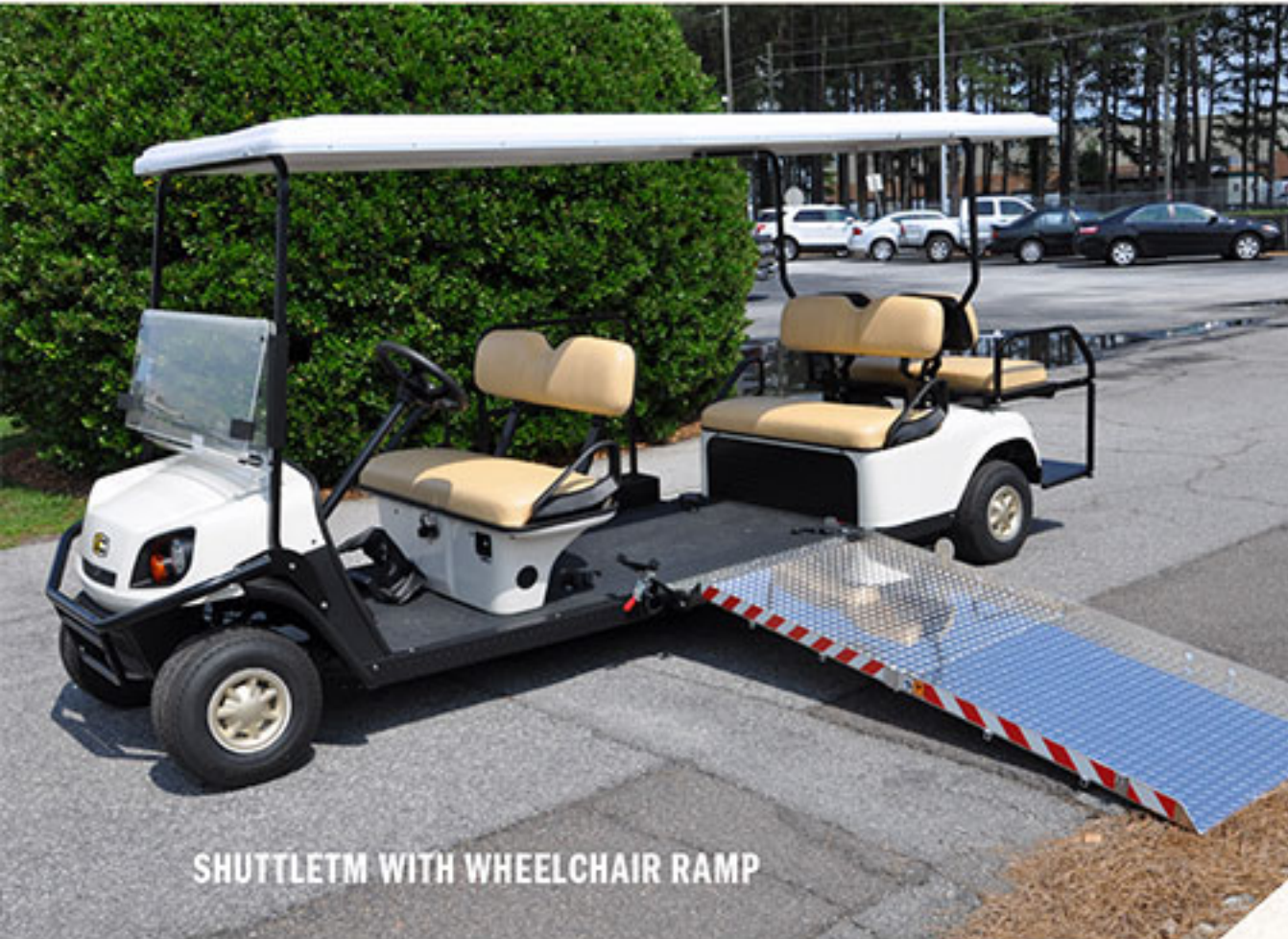
SHUTTLE™ WITH WHEELCHAIR RAMP